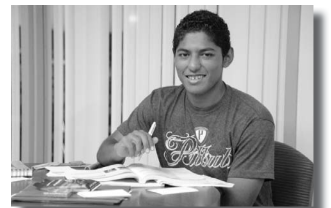
If you are trying to identify a program that will help you increase

One year certificate graduates: MTH080 proficiency is required. However, individual programs may require a higher mathematics competence. This requirement may be fulfilled by placement test, proficiency test, or by taking the course.